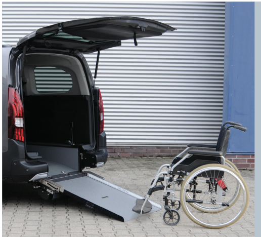
With the unfolded ramp the vehicle can be accessed comfortably with a wheelchair.