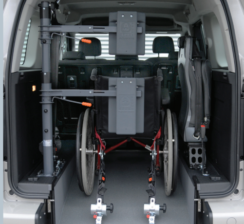
The head & backrest FUTURESAFE (optional) provides additional safety.