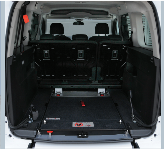
Optional EASYFLEXI ramp folded flat allows full use of the luggage area.